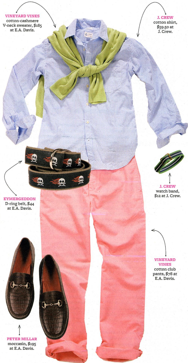
VINEYARD VINES cotton-cashmere V-neck sweater, $185 at E.A. Davis.

FASHION Send style news to tsutton@globe.com .